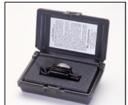
Double walled padded storage case (optional)

Used by physicians and therapists in clinics and rehabilitation centers