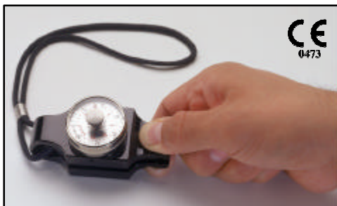
Accurate measure of pinch strength

Used by physicians and therapists in clinics and rehabilitation centers